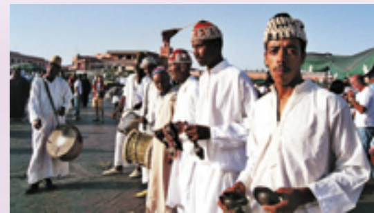
Musicians at the Jemaa el Fna

If one considers that the size of the premiums handled by the three pools of FAIR only accounts for about $150 million annually only, the scope for greater co-operation and business exchange seem limitless. Just take the example of oil and gas. Mr Ezzat Abdel-Bary, revered Secretary General of FAIR, said that with the Afro-Asian countries accounting for more than 77% of the global reserves, and 53% of the total world production, he hopes to see "Afro-Asian insurers banding together, pooling resources and developing regional capacity for having a reasonable share of this important but high-risk industry". In the person of Mr Abdel-Bary, FAIR has a dedicated regional figure imbued with the varied dictates of the insurance business having served as a Cabinet Undersecretary, as a regulator, as a CEO of a public insurer and a regional reinsurer, as an insurance law draftsman, and as an insurance lecturer.