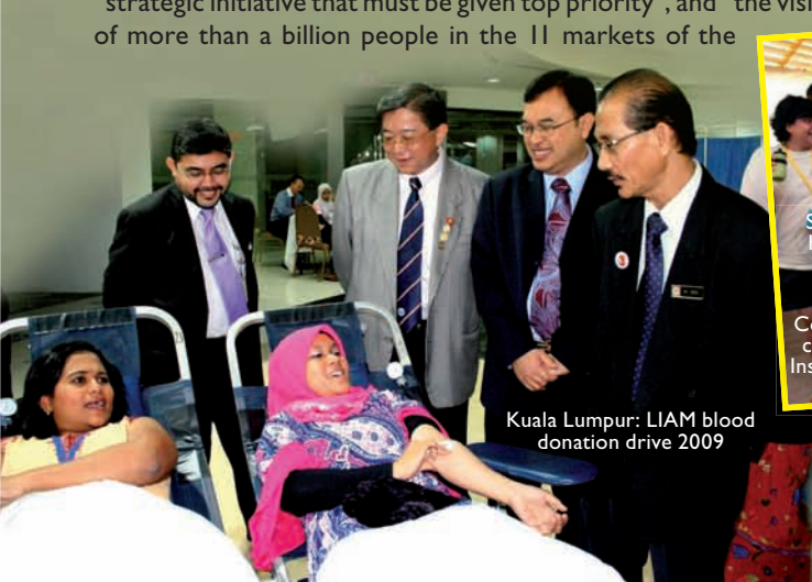
Kuala Lumpur: LIAM blood donation drive 2009

Despite all the steps taken gingerly to promote insurance, it needs better PR and marketing. Although the actual value of the products