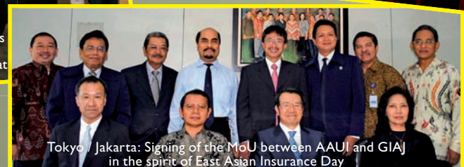
Tokyo / Jakarta: Signing of the MoU between AAUI and GIAJ in the spirit of East Asian Insurance Day