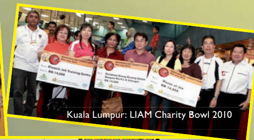
Kuala Lumpur: LIAM Charity Bowl 2010