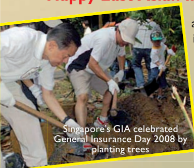
Singapore's GIA celebrated General Insurance Day 2008 by planting trees

and services offered is great and incredible in the eyes of the industry, the sales pitch is not compelling because the product is for a "rainy day" which consumers hope will not come or for use when they are gone, another prospect no one revels in. So the industry needs a new angle to fire the minds of the public. What better way than to show the world what